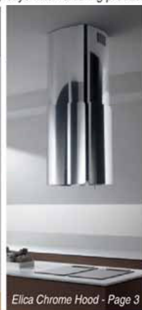
Elica Chrome Hood - Page 3