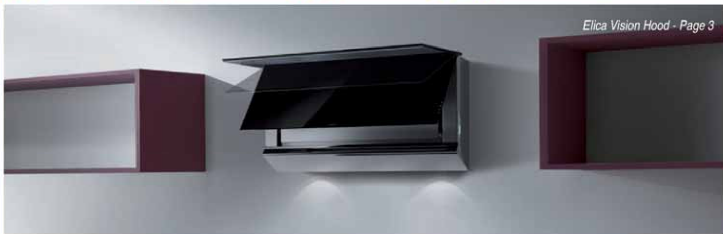
Elica Vision Hood - Page 3